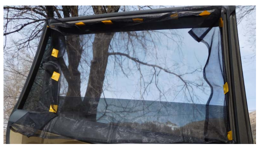
Figure 4. If you can't secure the bottom of the screen with magnets, it is helpful to keep the screen tight between the side magnets and to keep the window rolled up a few inches (8 cm.).