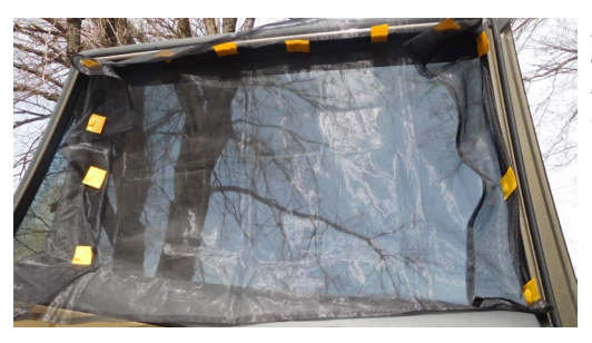
Figure 3. The screen and magnets placed inside a window frame.