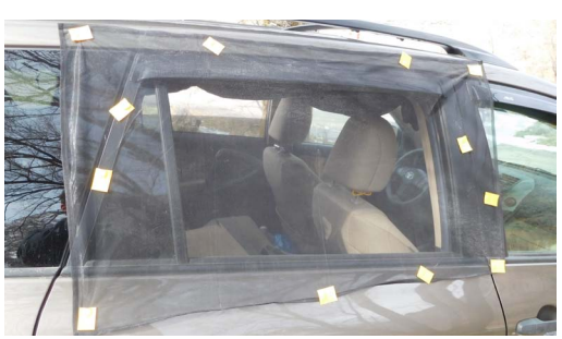
Figure 1. The screen and magnets placed on the outside of a vehicle. (Note that the magnets are lighter in color to improve visibility in the photos.)

Position the Bug Screener over a window, and place the magnets as needed to hold the screen in place. (See Figure 1). If the window is part of a door that you will be opening and closing while using the Bug Screener, make sure the magnets are attached to the door only and not to the other parts of the vehicle. It may be necessary to fold over the edges of the window screen so they don't get caught in the door when closing it. (See Figure 2).