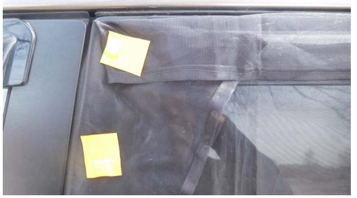
Figure 2. If you will be opening and closing the door with the window screen on it, you may have to fold the edges of the screen under the magnets so the screen won't get caught when the door is being closed.

One size fits most vehicles. Open for instructions.